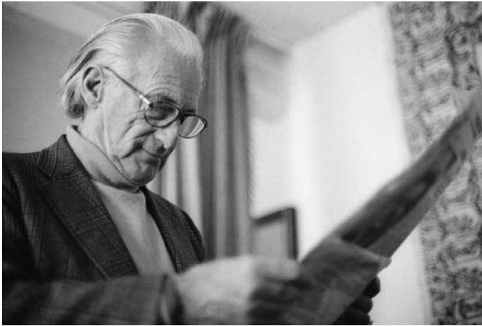
“The Head of Don Quixote”: Henri Lefebvre, 1978.