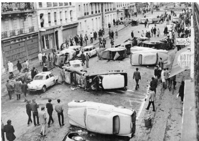
The Explosion: Paris, May 1968.