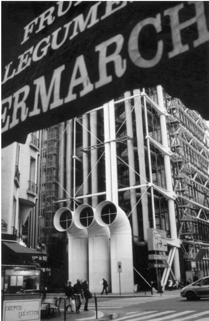
The Pompidou Center: from Lefebvre's front door, rue Rambuteau, Paris.