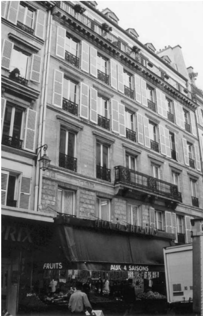
Chez Lefebvre, 30, rue Rambuteau, Paris.