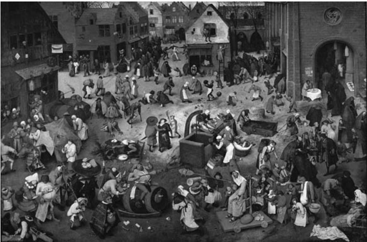
Bruegel, Pieter the Elder, Fight Between Carnival and Lent , 1559. Kunsthistorisches Museum, Vienna, Austria.